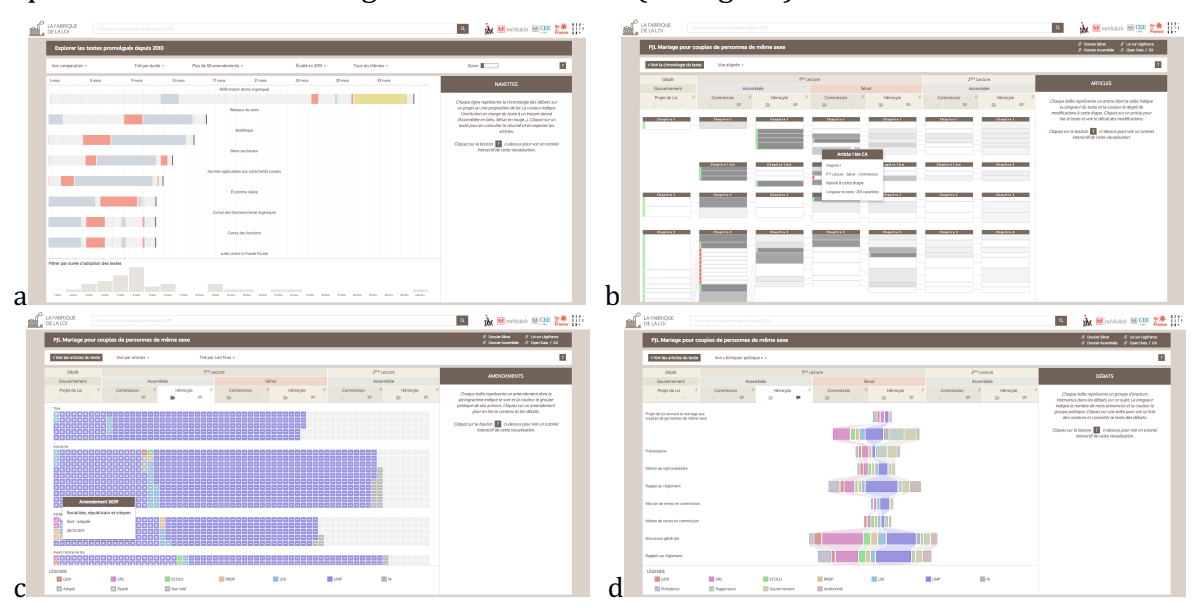
Figure Error! No sequence specified. Four interfaces of the <u>lafabriquedelaloi.fr</u> platform

The potent formalization offered by Git allowed to create an extremely flexible visual online interface allowing, scholars, journalists and engaged citizens to explore the lawmaking process of the French Parliament (<u>lafabriquedelaloi.fr</u>). The exploration starts from a vast overview comparing how long different laws were discussed in different branches of the parliament and how many words were changed through these discussions (see fig. 1a). It then allows users to drill down progressively disaggregating the data and identifying how precisely each article of each law was modified at each passage (see fig. 1b); considering all amendments proposed by different political groups (see fig. 1c); and reading the transcription of each word spoken by each parliament member on each specific article at each stage of the discussion (see fig. 2d).